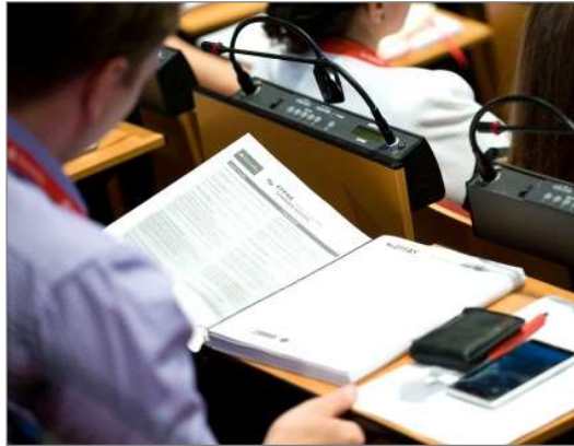
The Santander financial City hosts EFFAS Summer School