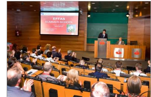
Auditorium EFFAS Summer School